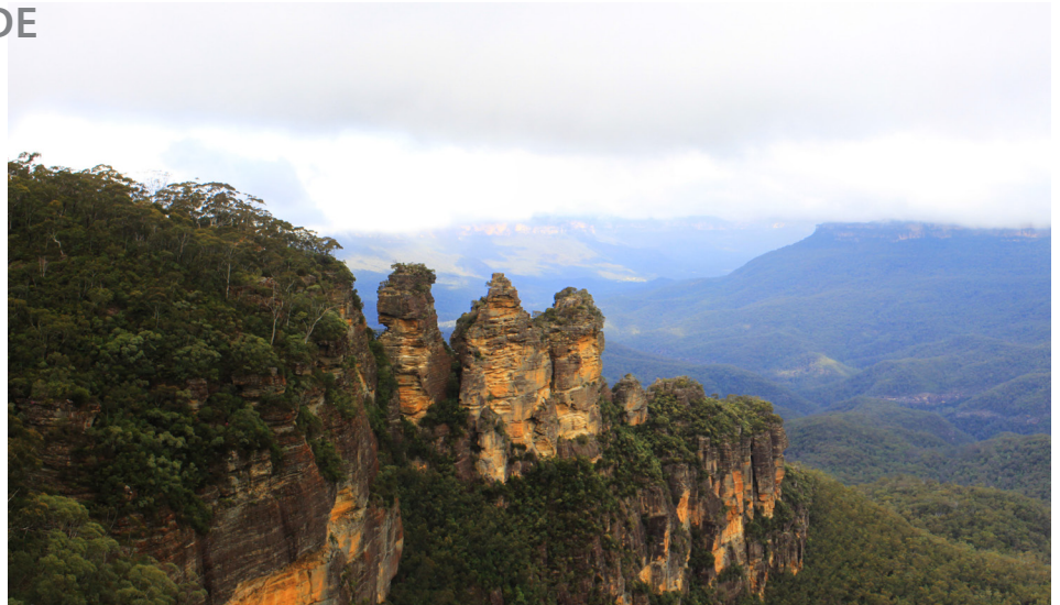
The Three Sisters

The area is rich in marine life such as migrating whales, vast schools of friendly dolphins, basking sunfish, manta rays, or acres of pelagic fish.